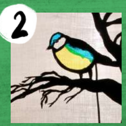
Wed 20th May