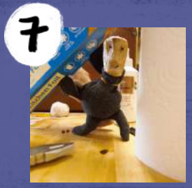
Mon Ist June