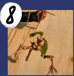
Wed 3rd June

When you want a puppet that can run and jump as quickly as your fingers, you can't do better than a runner glove puppet! See website for bonus Tuesday 2<sup>nd</sup> June activity from Life and Limb — 'Silly-ian Marionettes'!