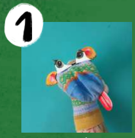
Mon 18th May