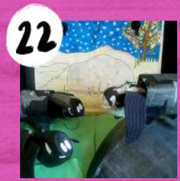
Mon 6th July

What can you discover when you look inside a pot? Bring to life your very own wriggly creature that pops out of a pot. Meet the friendly troll puppet from the woods who will join Mark and Iklooshar and help you make a wonderful puppet to dance with in the kitchen!