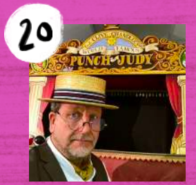
Wed Ist July