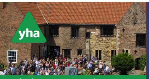
Thank you to YHA Beverley Friary – our original festival partner