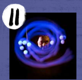
Wed 10th June

Moth Physical Theatre will teach you how to build your own indoor or outdoor puppet theatre, decorating it with everything but the kitchen sink. You'll learn how to create a simple puppet using items you can find in and around your home. Together we'll explore how and where we give these puppets life, finding their breath, movement, vocal qualities and using your own body.