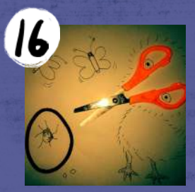
Mon 22<sup>nd</sup> June

Create the magic of effective puppet movement in this fun "how to" workshop. Martin and Su from Hand to Mouth Theatre will demonstrate a simple puppet sequence of planting a seed and growing, just as it happens in their much-loved show "Piggery Jokery".