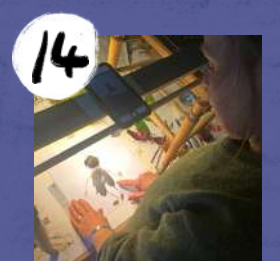
Wed 17th June

Make a simple muppet-style puppet from paper plates. Learn how to make them talk. With a little practice your puppet characters will soon be singing songs and dancing to your favourite music.