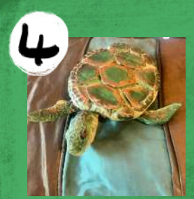
Mon 25th May