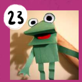
Wed 8th July