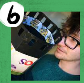
Sat 30th May

Noisy Oyster will be showing you how you can use vegetables, fruit, and a variety of kitchen objects to bring popular nursery rhymes to life. Join the Right Royal Chefs in their kitchen, and they will show you how playing with your food is not always a bad idea.