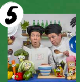
Wed 27th May

Circo Rum Ba Ba will help you build a Leatherback Turtle puppet, the star of their show "Plastic Ocean". They will guide you through each step, so you finish with a realistic and stunning puppet. The puppet is worn on the back of the hand with moving head and front fins to swim effortlessly through your home performances.