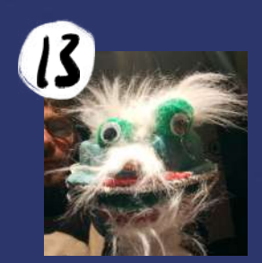
Mon 15th June