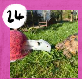
Sat IIth July

Inspired by the Toad from Norwich Puppet Theatre's 'Thumbelina', learn how to make your own moving mouth paper puppet. All you'll need is some A4 paper (preferably green - but you can always add colour to white), some scissors, sellotape and a pen. A simple design which can be used to make all sorts of characters for your own puppet play at home.