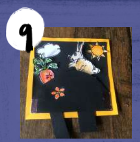
Sat 6th lune

Learn how to make a unique marionette using natural and found objects from your garden, readily available art materials and...a potato! This activity encourages the sustainable use of recyclable materials that can be either reused or composted, continuing the cycle of renewal and growth.