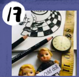
Wed 24th lune